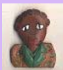
First People Cane