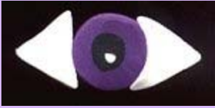
Image A shows the coiling of the clay Image B shows how the iris looks after being cut.

we'll call this violet. If you like, use a Skinner Blend for the irises.